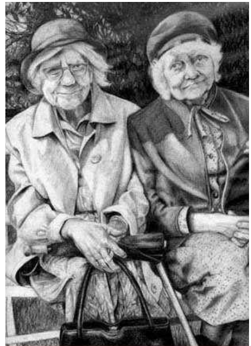
Two little old ladies were attending a rather long church service. One leaned over and whispered, "My butt is going to sleep." "I know," replied her companion, "I heard it snore three times."

The GIANT hunts will be available starting October 4th.