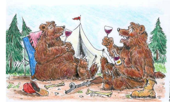
I finally remembered—red with hunter, white with fisherman.

The GIANT hunts will be available starting October 7th.