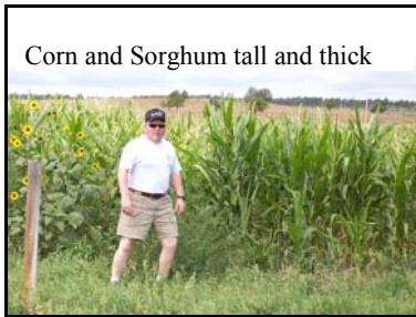
Corn and Sorghum tall and thick

If you want to hunt Quail, put together a group of no more than four and put your name on the list so we have a hunt or two saved for you....you will have a blast!