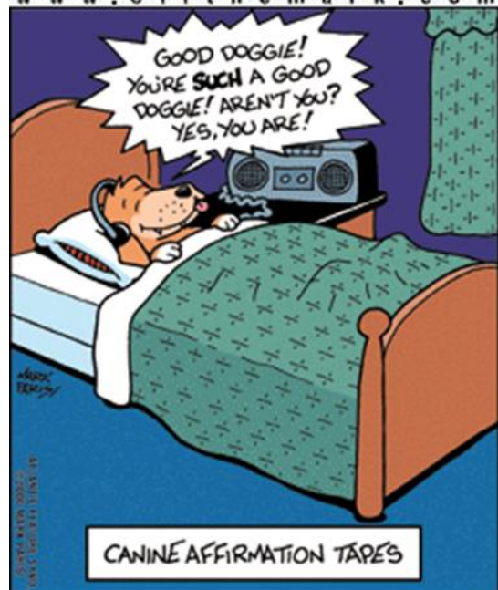
CANINE AFFIRMATION TAPES